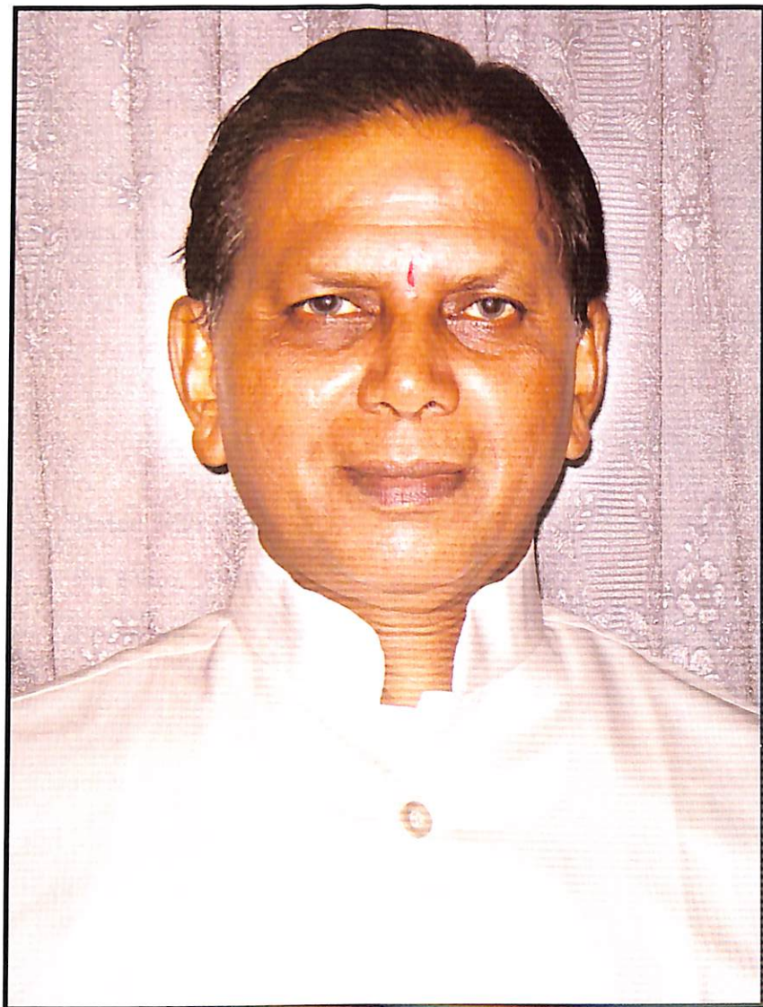
Shri Bhimananda Tanti Deputy Speaker Assam Legislative Assembly