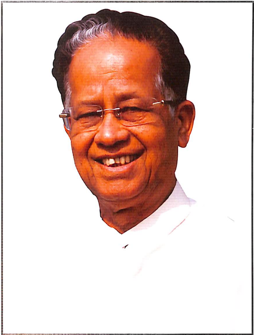
Shri Tarun Gogoi, Hon'ble Leader of The House and Chief Minister, Assam